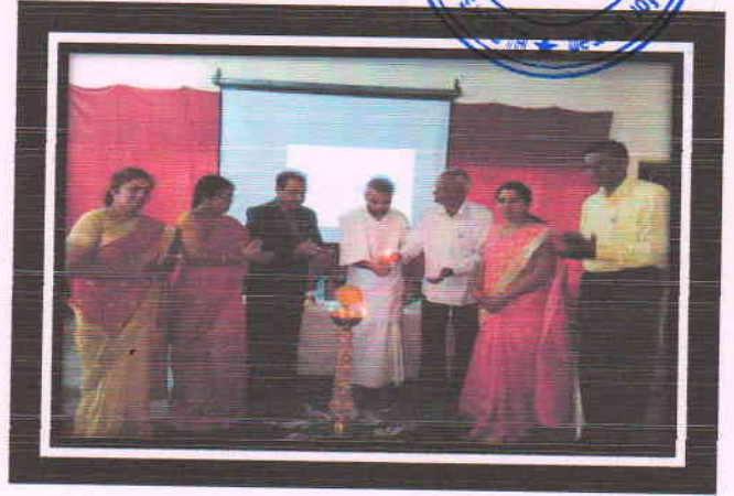
Lighting the Lamp by the dignitaries on the dies